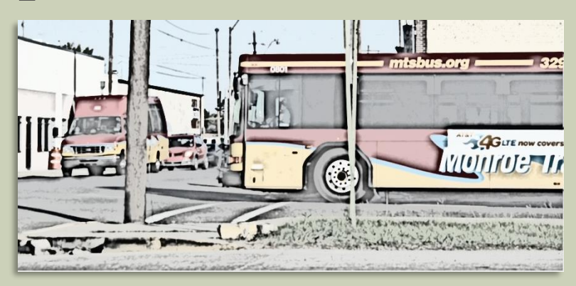
Mayor Friday Ellis

DBE GOALS FOR FY 2023-2026 September 27, 2023, 3:00PM