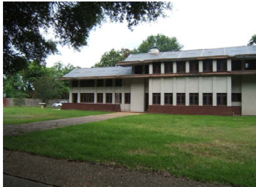
G.B. Cooley House, a Prairie Style house by Walter Burley Griffin that is nationally recognized for its architectural significance

Also listed on the National Register are two Historic Districts: the Downtown Monroe Historic District and the Monroe Residential District. The Downtown Monroe Historic District is architecturally significant as the finest historic central business district in Northeast Louisiana. This district consists of 57 buildings including three pre-Civil War buildings: the Clerk of Court’s Office (c. 1816), the Isaiah Garrett Law Office (1840) and the Fred Levi Building (1854).