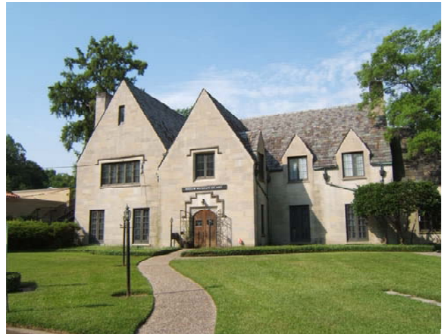
Slagle House, a national register historic property that now houses the Masur Museum of Art.

The Slagle House at 1400 South Grand Street was donated to the City of Monroe in 1963 for use as an art museum. This Tudor style building is Northeast Louisiana’s largest visual arts museum and features six to eight temporary exhibits each year as well as a permanent collection. The mission of the Masur Museum is to “provide a quality visual arts experience through temporary exhibitions, educational activities and programs, and collections management, for the citizens of the City of Monroe and the community of Northeast Louisiana.” Additional information can be found at www.monroela.us/masurmuseum.php .