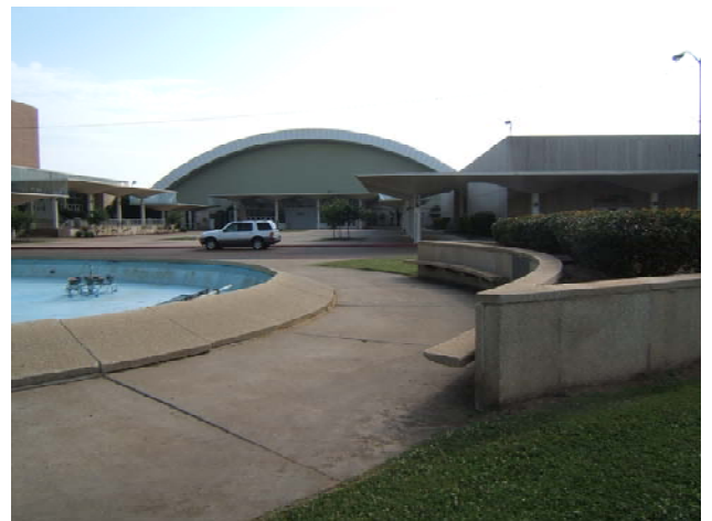
The Monroe Civic Center

Located at 401 Lea Joyner Memorial Expressway, the Monroe Civic Center features an arena, conference hall, convention center, equestrian pavilion and the W.L. “Jack” Howard Theatre. Additional information can be found at www.monroela.us/civiccenter.php .